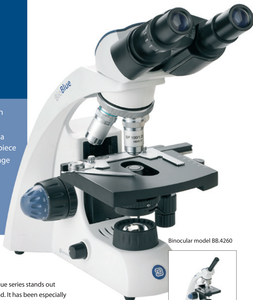
Binocular model BB.4260